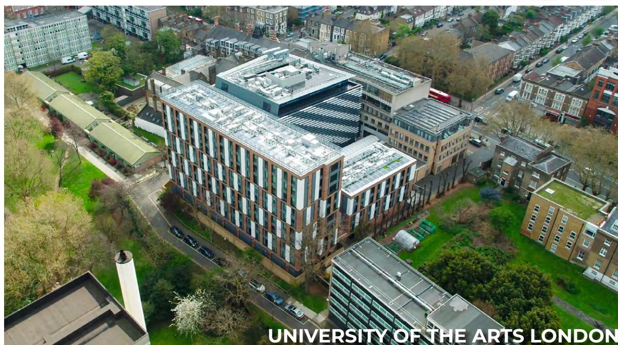
UNIVERSITY OF THE ARTS LONDON