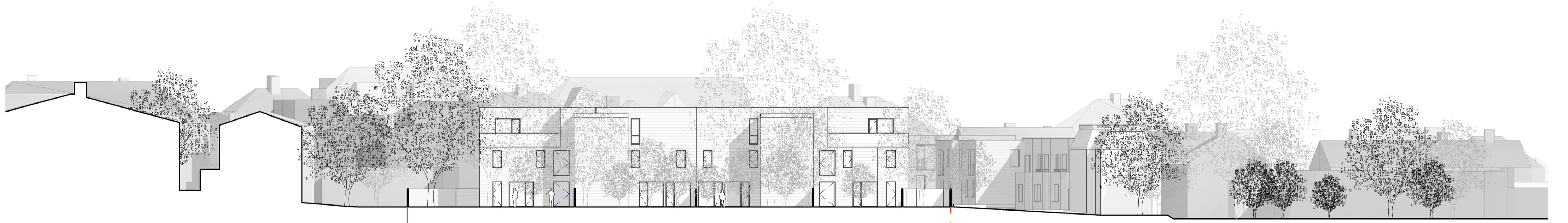
2 South-West Elevation Building A 200@A1 1 : 200

NOTES CONSULTANTS - Refer to highways consultant's drawings for details - Refer to landscape consultant's drawings for details - Landscaping layout is indicative only AREAS - Refer to area schedule © Copyright Reserved. ColladoCollins Partners LLP