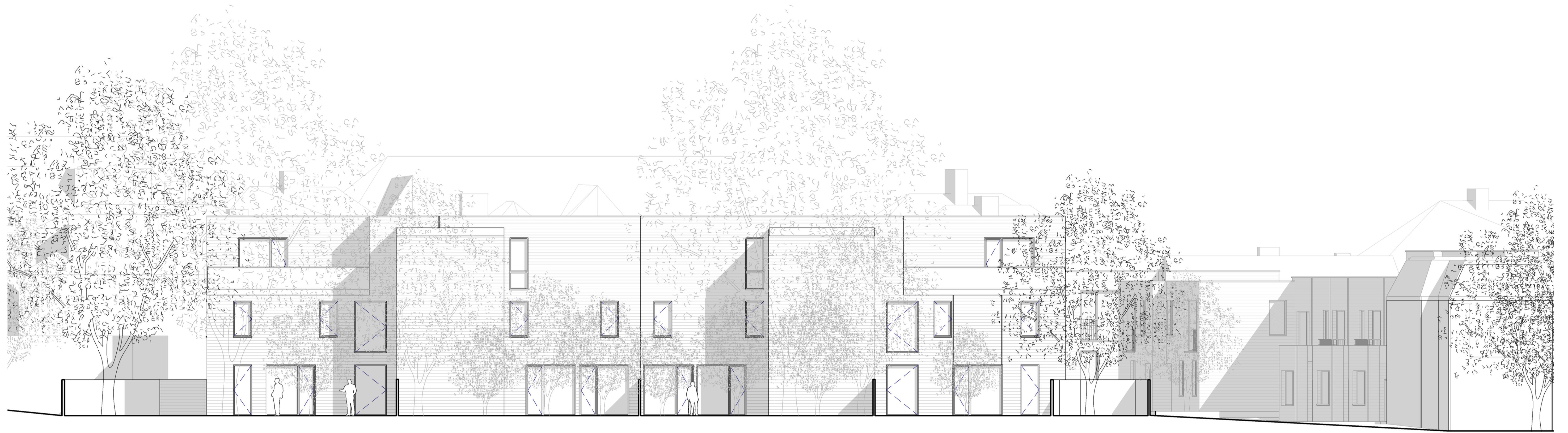
1 South-West Elevation Building A 100@A1 1 : 100