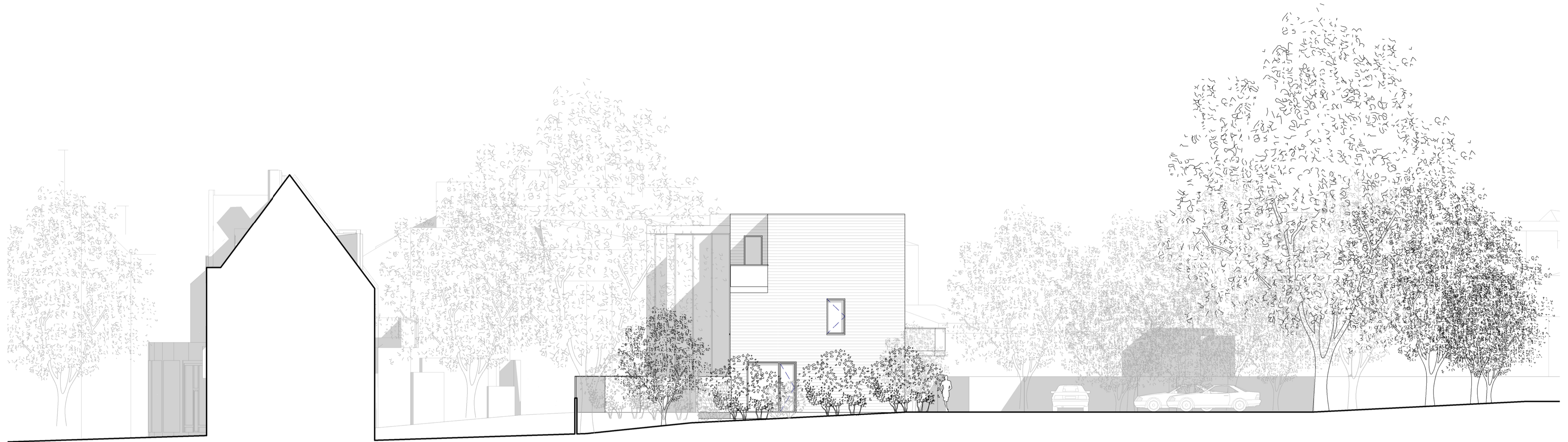
1 South-East Elevation Building A 100@A1 1 : 100