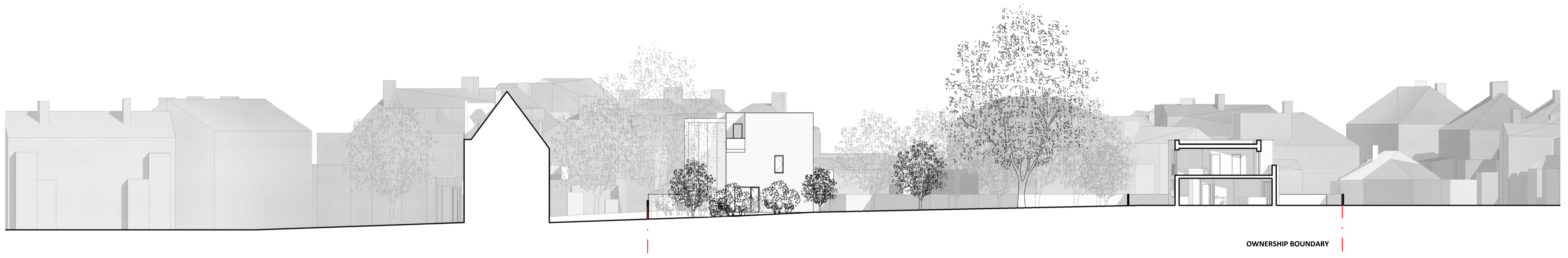
2 South-East Elevation Building A 200@A1 1 : 200

NOTES CONSULTANTS - Refer to highways consultant's drawings for details - Refer to landscape consultant's drawings for details - Landscaping layout is indicative only AREAS - Refer to area schedule © Copyright Reserved. ColladoCollins Partners LLP