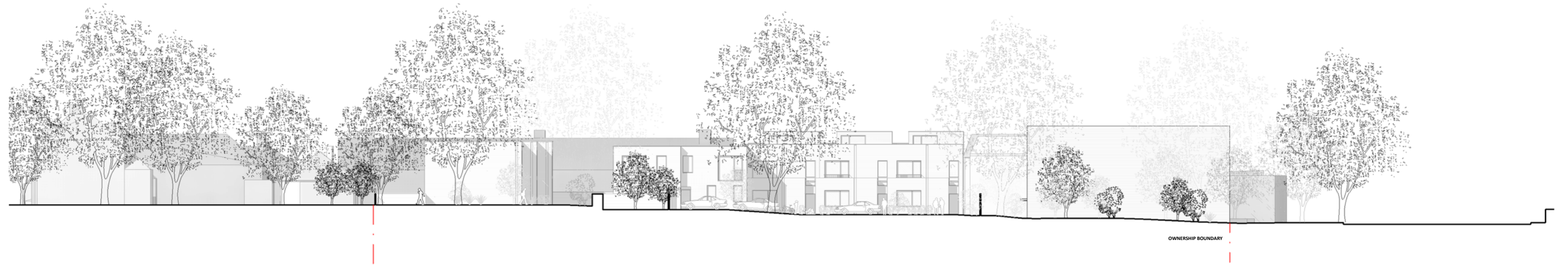
2 North-West Elevation Building C 200@A1 1 : 200

NOTES CONSULTANTS - Refer to highways consultant's drawings for details - Refer to landscape consultant's drawings for details - Landscaping layout is indicative only AREAS - Refer to area schedule © Copyright Reserved. ColladoCollins Partners LLP