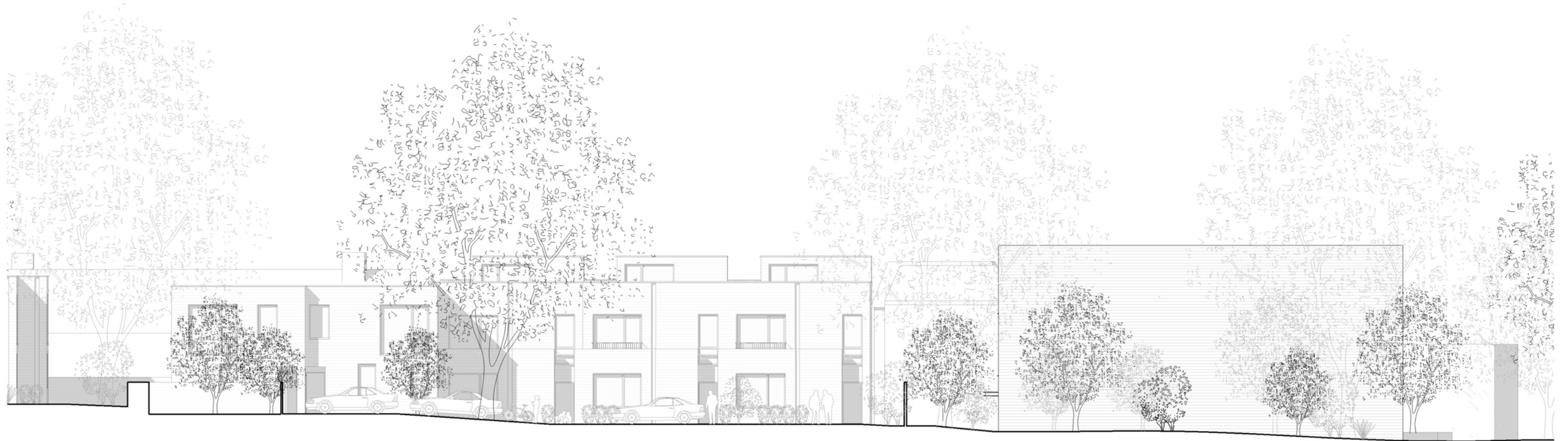
1 North-West Elevation Building C 100@A1 1 : 100