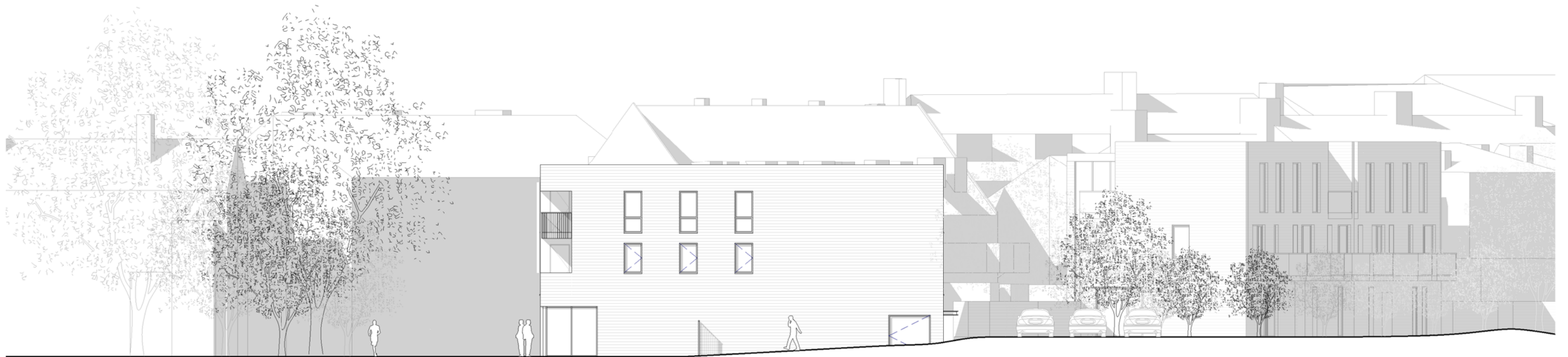
1 South East Elevation Building C 100@A1 1 : 100