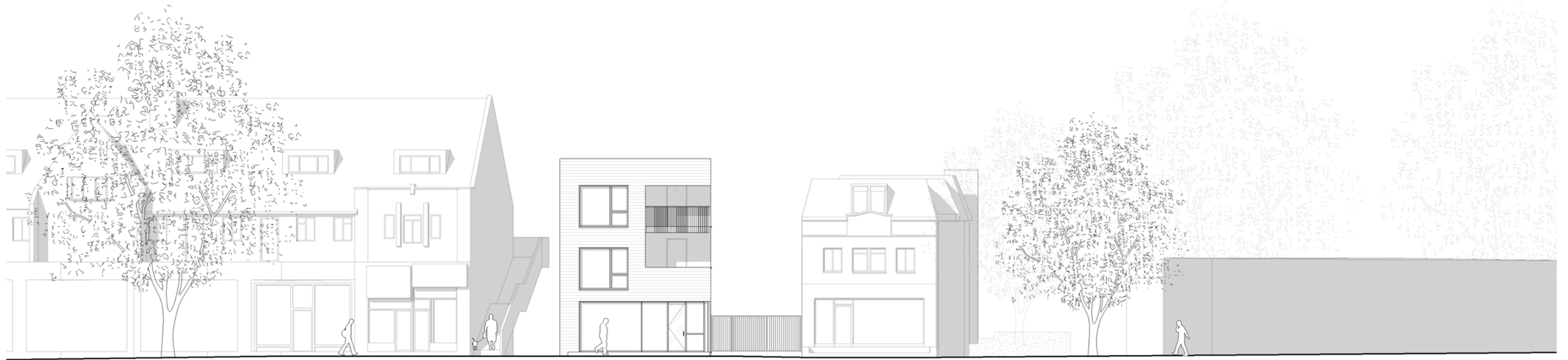
1 South-West Elevation Building C 100@A1 1 : 100