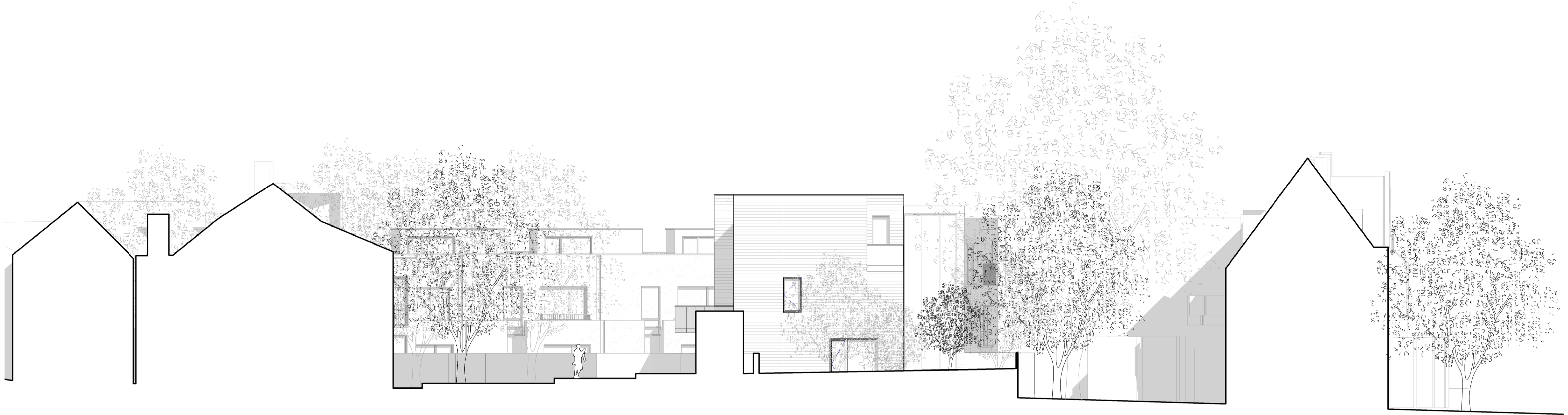
1 North-West Elevation Building A 100@A1 1 : 100