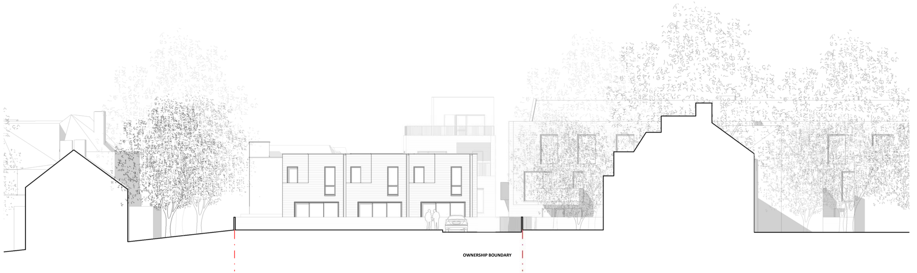
1 Mews North East Elevation 100@A1 1 : 100