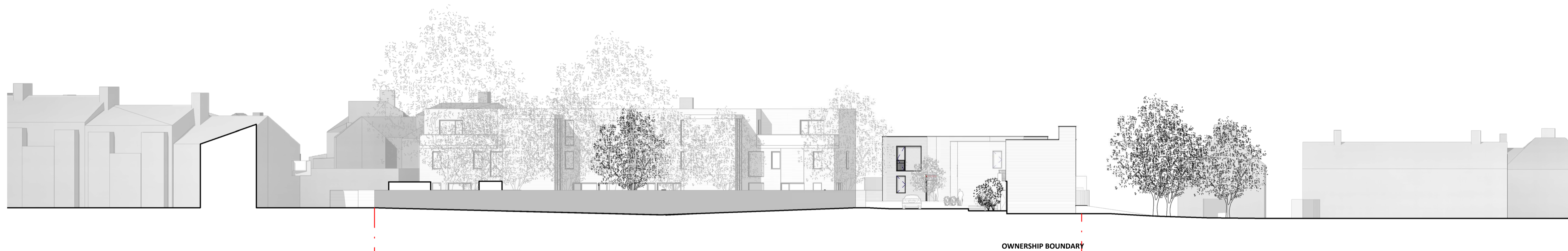
2 Mews South West Elevation 200@A1 1 : 200

NOTES CONSULTANTS - Refer to highways consultant's drawings for details - Refer to landscape consultant's drawings for details - Landscaping layout is indicative only AREAS - Refer to area schedule © Copyright Reserved. ColladoCollins Partners LLP