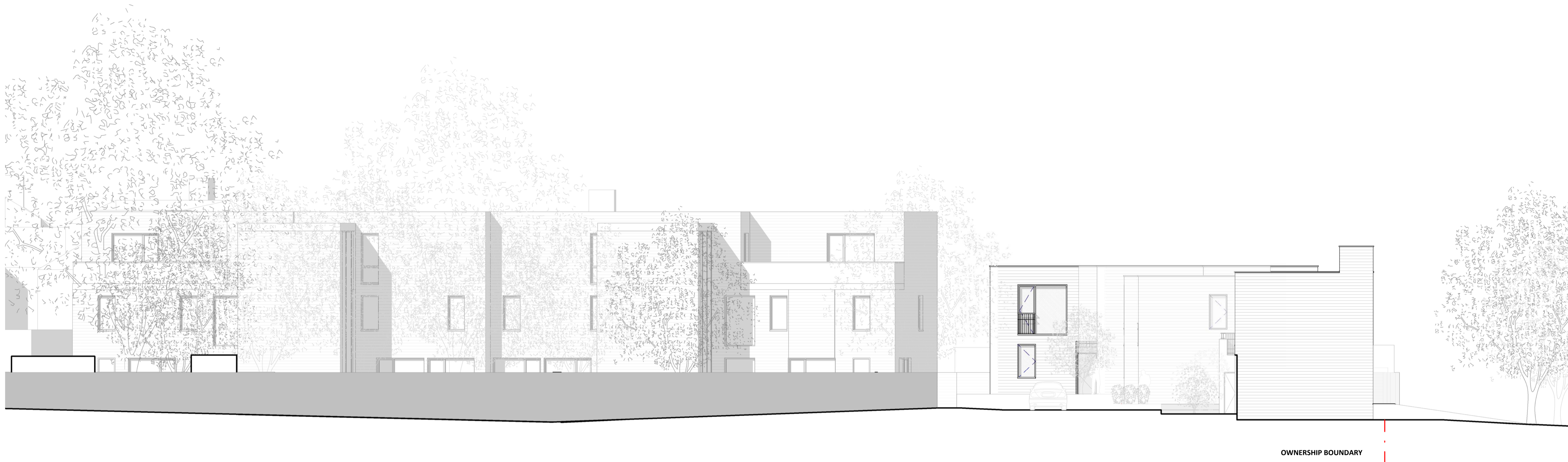
1 Mews South West Elevation 100@A1 1 : 100