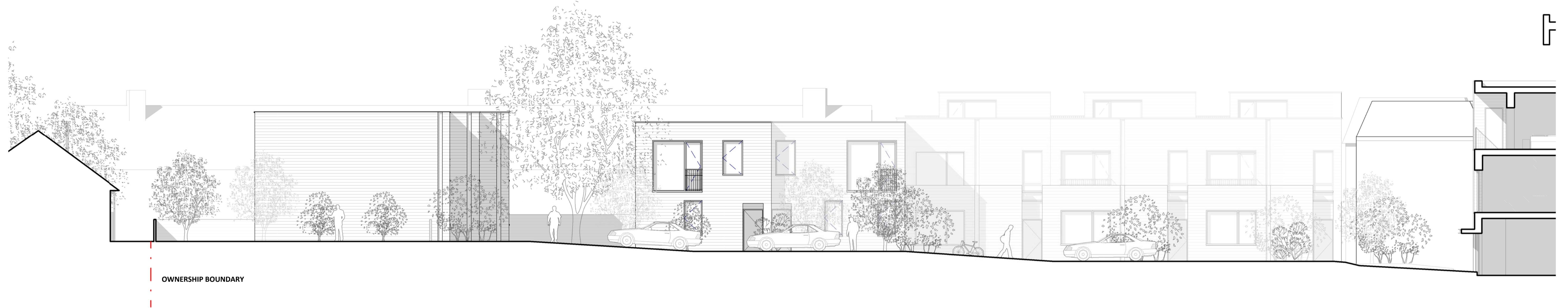
1 Mews North West Elevation 100@A1 1 : 100