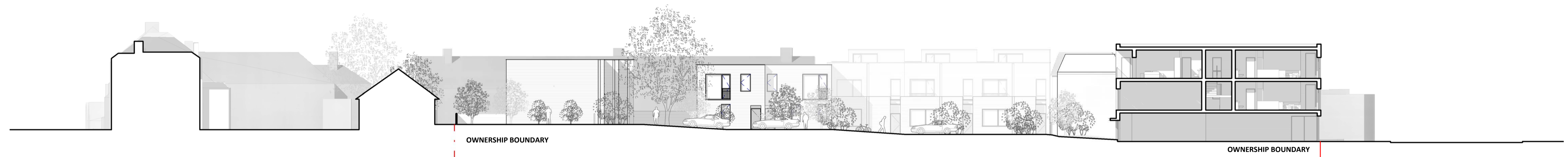
2 Mews North West Elevation 200@A1 1 : 200

NOTES CONSULTANTS - Refer to highways consultant's drawings for details - Refer to landscape consultant's drawings for details - Landscaping layout is indicative only AREAS - Refer to area schedule © Copyright Reserved. ColladoCollins Partners LLP