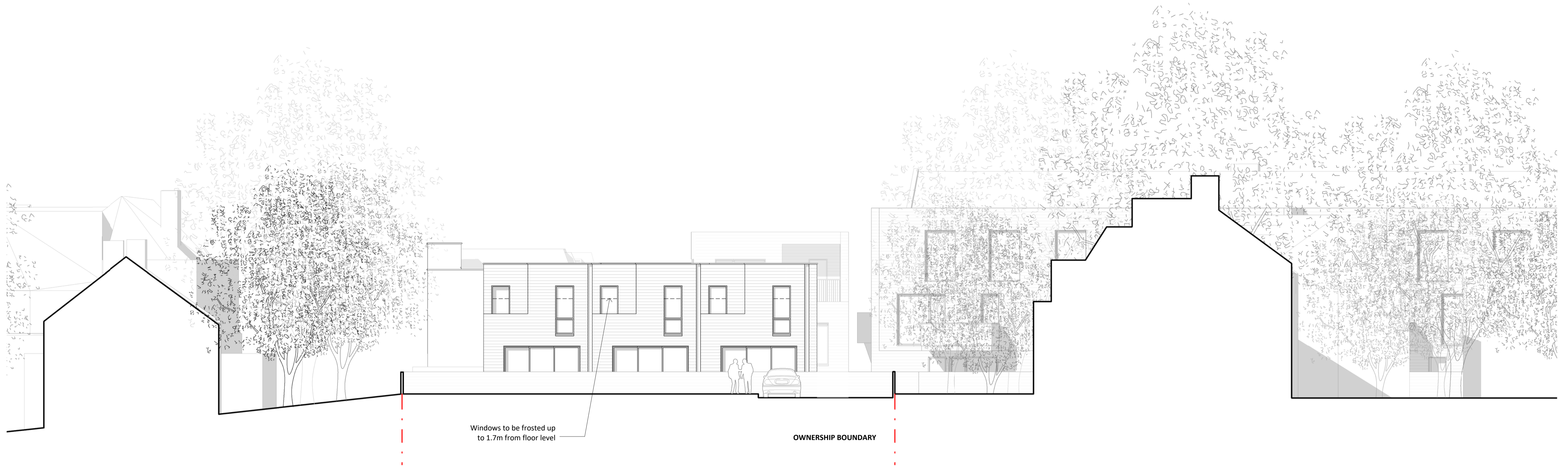
1 Mews North East Elevation 100@A1 1 : 100