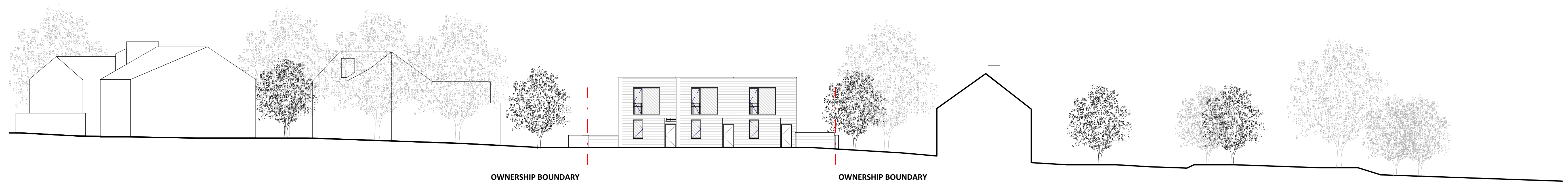
2 Mews Section DD 200@A1 1 : 200

NOTES CONSULTANTS - Refer to highways consultant's drawings for details - Refer to landscape consultant's drawings for details - Landscaping layout is indicative only AREAS - Refer to area schedule © Copyright Reserved. ColladoCollins Partners LLP